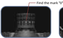
⑥ INSTALL THE TOP SCREW